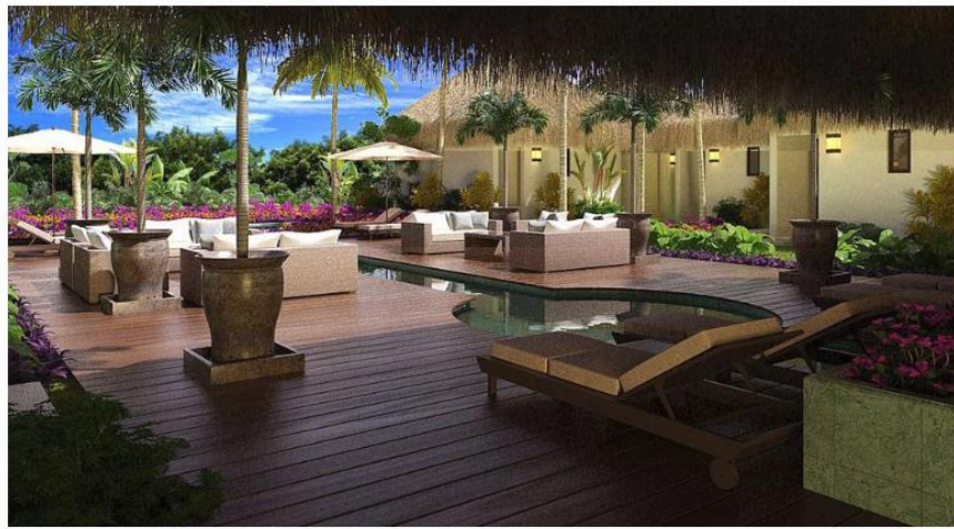
The latest opening: Chablé Maroma

While this, the group's first resort, is all about the jungle, the next property – Chablé Maroma , which is due to open next month – is all about the ocean. Found on the pristine beach of Maroma , in Riviera Maya, it is surrounded by lush mangroves on Mexico's Caribbean coastline, and will feature 70 spacious villas, each with its own private pool and outdoor terrace.