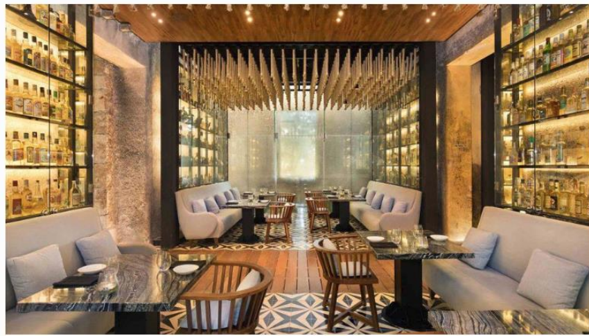
The glamorous restaurant that is Ixi'im