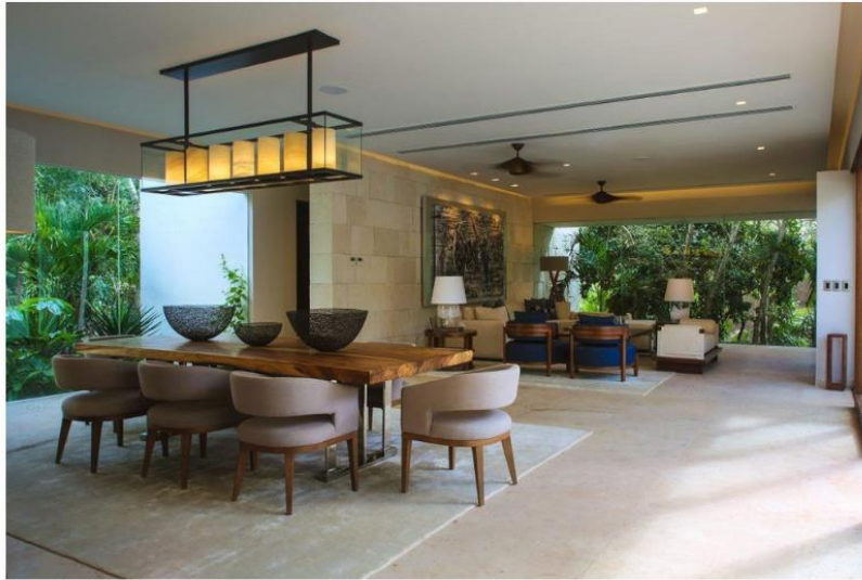
Inside the Chablé Resort Yucatán.

When Hamak Hotels opened its first Chablé property on Mexico's Yucatan Peninsula early last year, it created a buzz among travel connoisseurs all over the world.