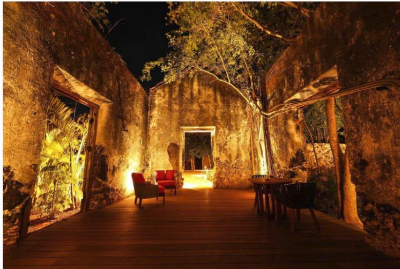
The magical entrance to Chablé Resort Yucatán.

Wowed by its rough-hewn (yet uber-luxe) hacienda style, it charmed even the most jaded jet-setters with its artsy design ethos – think: antique tiles, bright art and local textiles – and it set a marker in the sand for a new level of luxury.