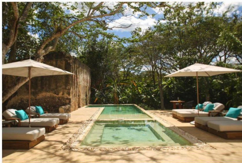
The resort is carved out of an old factory building

Adding to its sparkle, is the fact that Chablé Resort is found in a remote spot in the Mayan jungle, 25 minutes from the historic city of Mérida – all the better for dinner-time boasting back at home. There are 38 stand-alone contemporary casitas spread across the 750-acre estate, each with a pool, not to mention a sprawling Presidential Suite and an even bigger Royal Presidential Suite – the latter costing an eye-watering $10,000 per night.