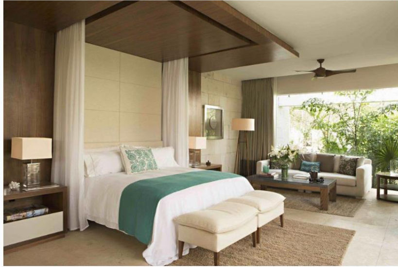
The bedrooms exude a clean style ethos

Carved out of a former sisal factory, it took 12 years to transform the estate into what is now a magical spa retreat with a standout restaurant and design-led interiors, with the property already collecting a cabinet full of awards.