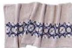
SEP JORDAN Cashmere shawl, £350. sepjordan.com