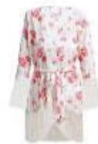
ATHENA PROCOPIOU Sundown Breeze fringed silk kimono, £395. boutique1.com