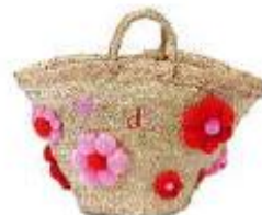
RAE FEATHER Deborah monogram pom pom basket, £210. raefeather.com