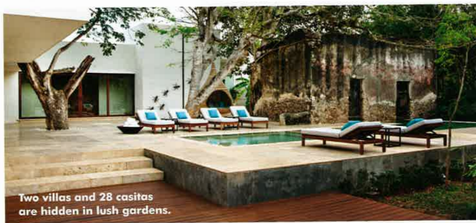
Two villas and 28 casitas are hidden in lush gardens.

Having 750 private acres in the heart of the Mayan forest and a sacred cenote almost all to ourselves seems a tad hedonistic, but why not? Save for the swish of a gentle breeze in the ancient trees and the occasional birdcall, it's unnervingly peaceful.