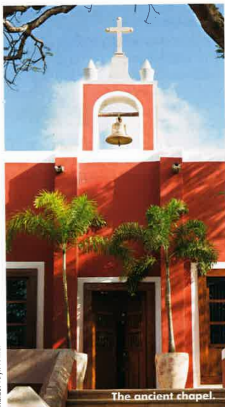
The ancient chapel.

Having 750 private acres in the heart of the Mayan forest and a sacred cenote almost all to ourselves seems a tad hedonistic, but why not? Save for the swish of a gentle breeze in the ancient trees and the occasional birdcall, it's unnervingly peaceful.