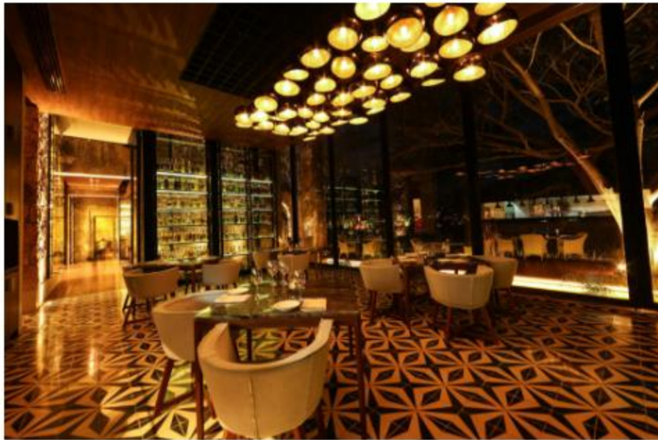
The tequila-lined dining room of lx'im

A fusion of traditional Mayan and modern touches. The luxe casitas, designed by architect Jorge Borja are tucked into the overgrown jungle hidden from the main path and feature their own infinity pool complete with draped hammock over the water and an indoor and outdoor shower overlooking umbrella plants. The villa is kitted out with iPad-controlled sound system and widescreen TV. Colour-popping Mexican tiles deck the veranda, channelling modern Mexican cool.