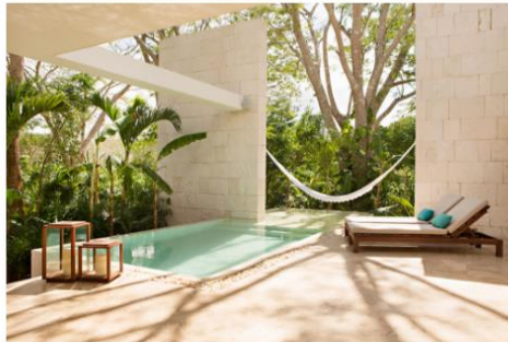
The king villa at Chablé