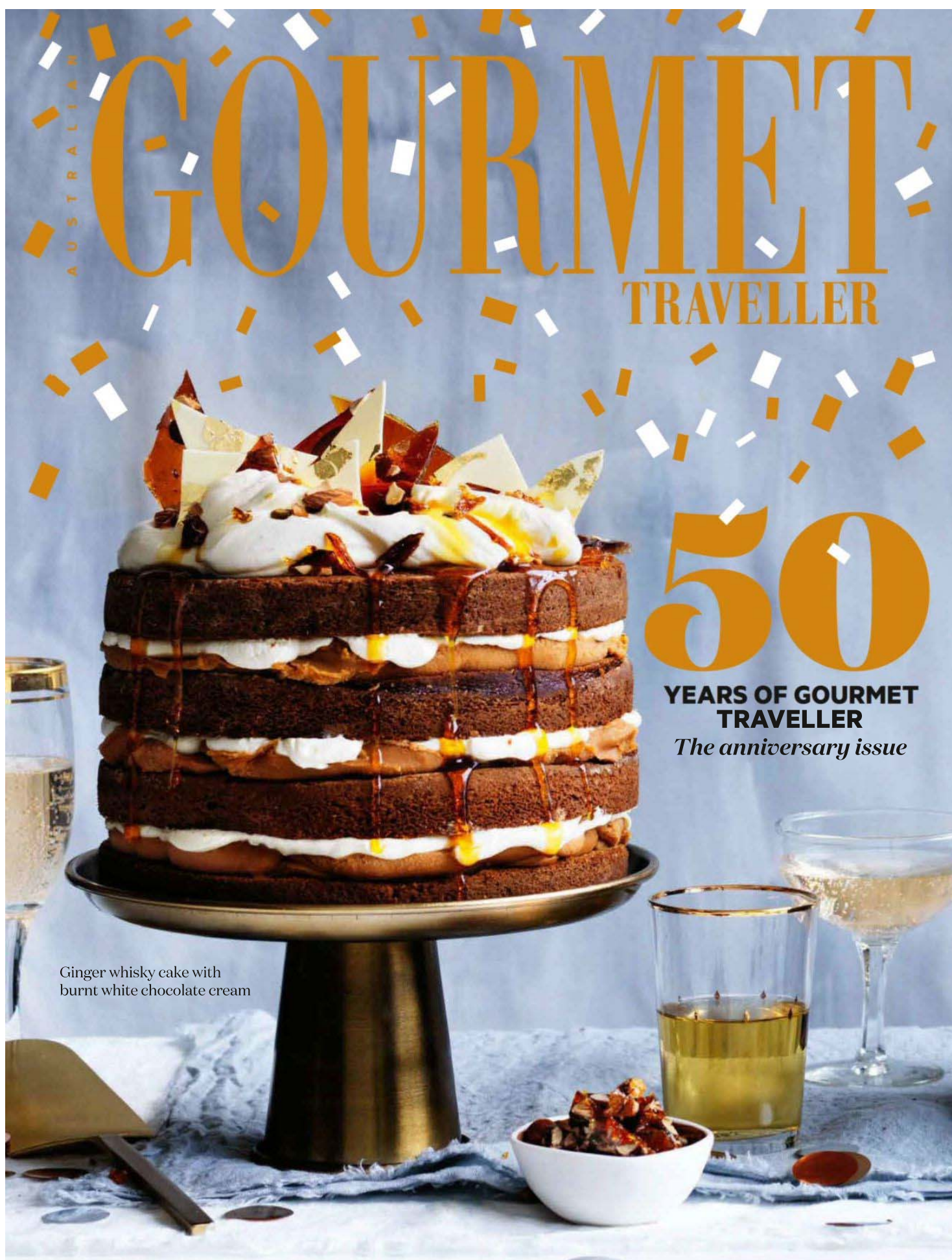
Ginger whisky cake with burnt white chocolate cream