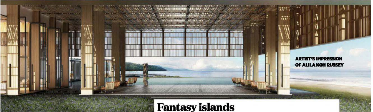
ARTIST'S IMPRESSION OF ALILA KOH RUSSEY