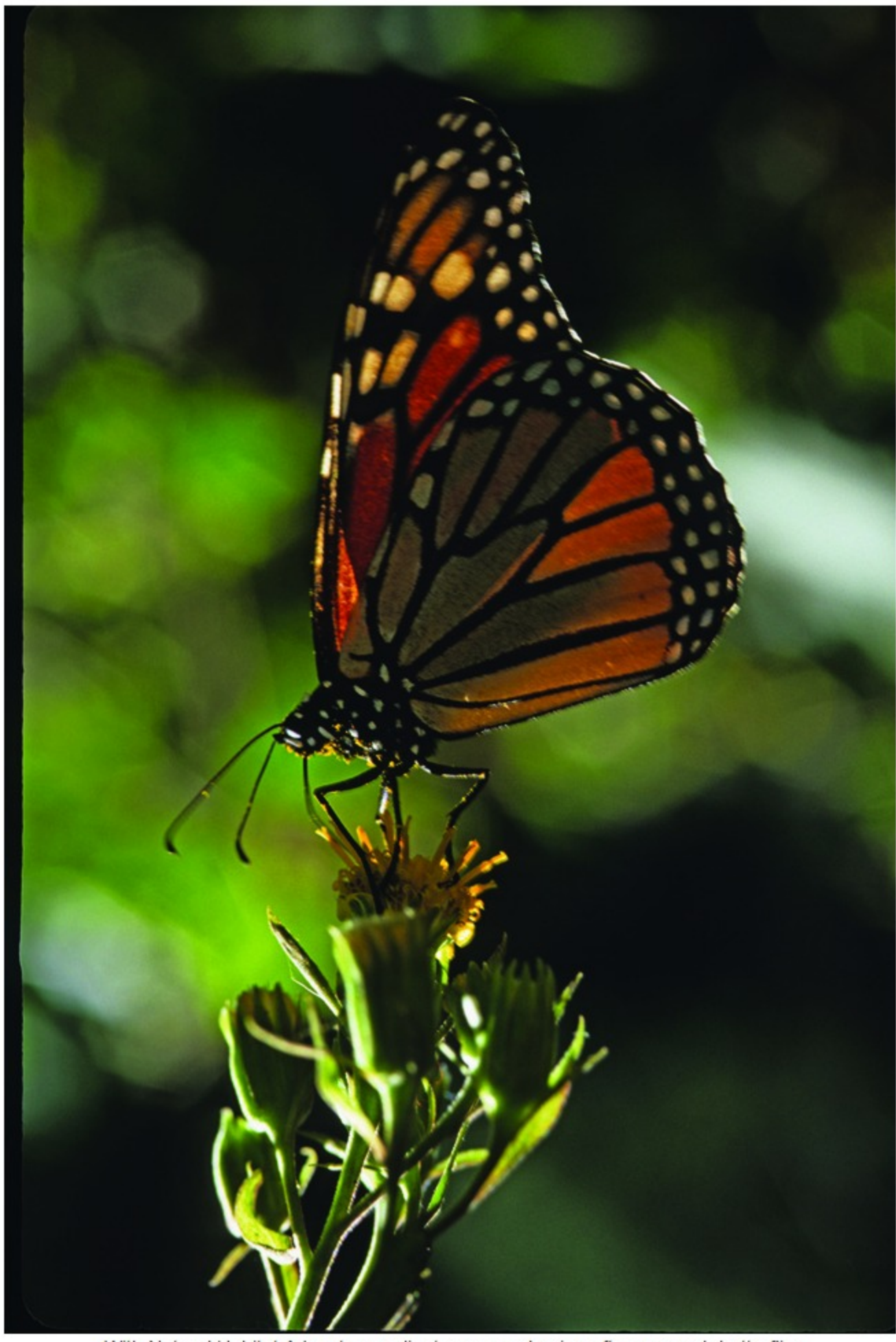
With Natural Habitat Adventures, clients can go chasing after monarch butterflies.

We've put together a selection of singular experiences that can only be made in Mexico .