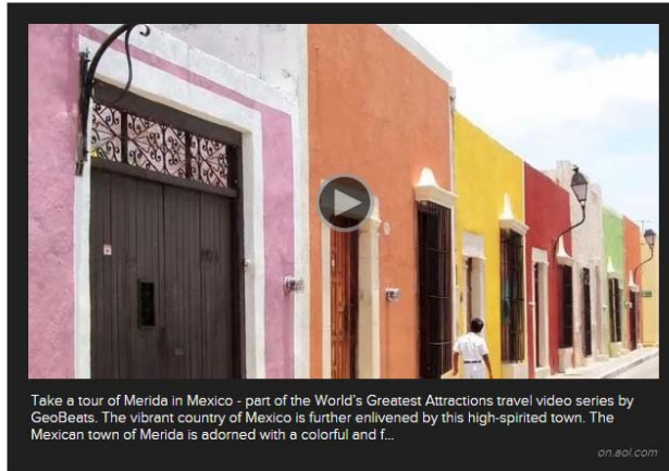
Take a tour of Merida in Mexico - part of the World's Greatest Attractions travel video series by GeoBeats. The vibrant country of Mexico is further enlivened by this high-spirited town. The Mexican town of Merida is adorned with a colorful and f... on.aol.com

📌 Truth behind those white spots on your nails, and what do they really mean?